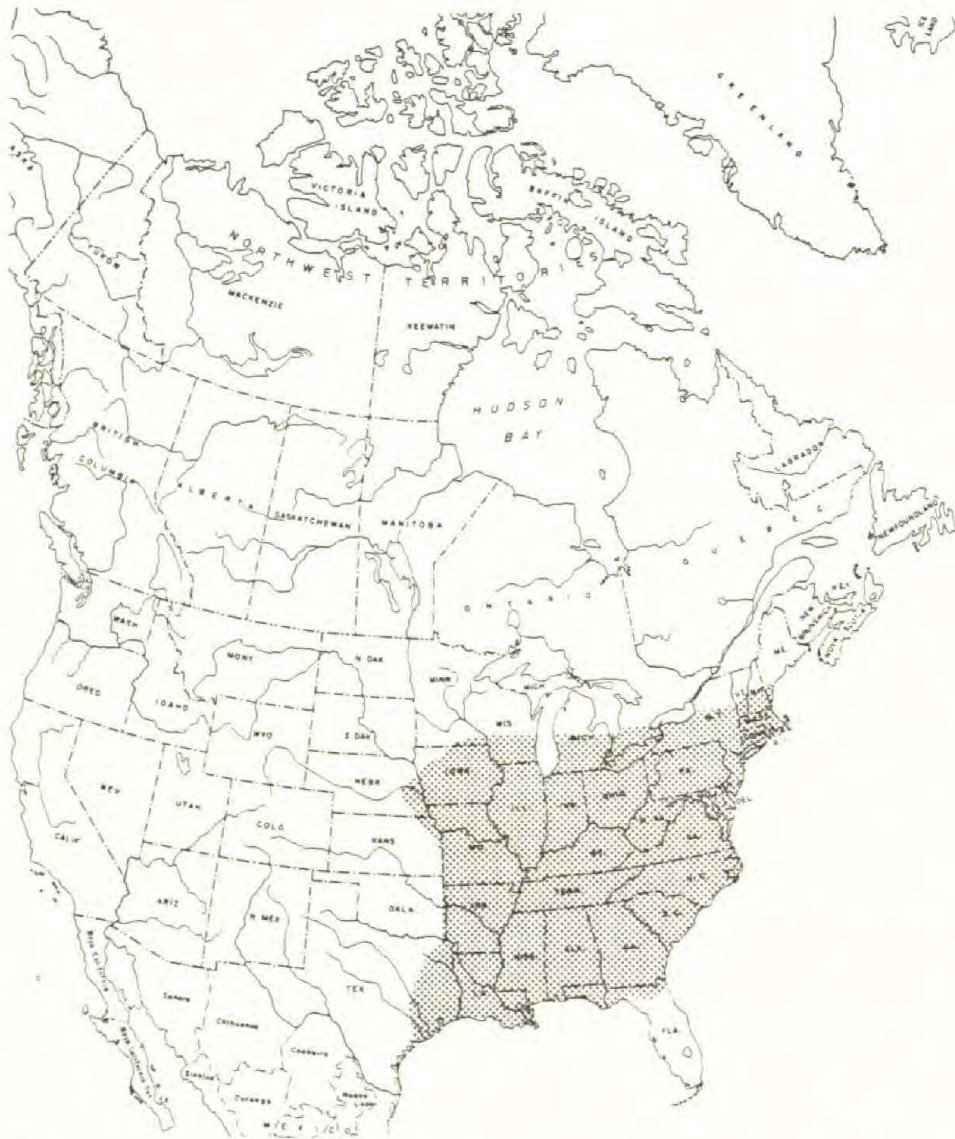
Figure 1. Eastern Deciduous Forest element: distribution of Corallorhiza odontorhiza (after Luer, 1975).

ered rare (Sorrie, 1989), are so because they may require a more specialized habitat, or suffer from habitat elimination and commercial exploitation. Some, such as Carex hitchcockiana and Blephilia hirsuta , require a rich, mesic, calcareous soil. Claytonia virginica , rare congener of the common C. caroliniana , has narrower habitat requirements of rich, open floodplains. Verbena simplex and Blephilia ciliata occupy dry, calcareous open situations. The somewhat rich, open woods habitat of Corallorhiza odontorhiza (Figure 1) is fairly common, but the plant is scarce; what its particular needs are, are not fully known. Plants that inhabit an early successional vegetational type, such as a calcareous wet meadow, are easily shaded out by taller growth. OphioGLOSSUM vulgatum and Veronicastrum virginicum are possible examples of rarity due to this process. Panax quinquefolius , while requiring rich sites, undoubtedly was more common before it became extensively hunted and the roots dug for herbal uses.